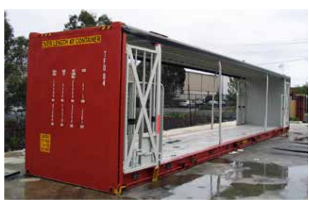
48ft x 2500 x 9ft 10" Hinged Gate Curtainside