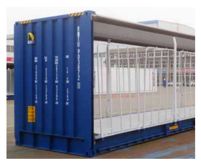
25ft x 2500mm x 9'6" Curtain Side

The 25ft curtainside container with mezzanine deck is fully intermodal, meaning it can be lifted loaded from the 25ft top lift position. It is suitable for loading pallets up to 1100mm high above and below the deck. It is designed to suit any pallet dimensions, and is fitted with suspended gate systems and load tested curtains.