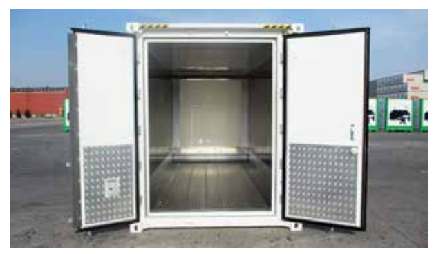
20ft ISO Electric Refrigerated Container