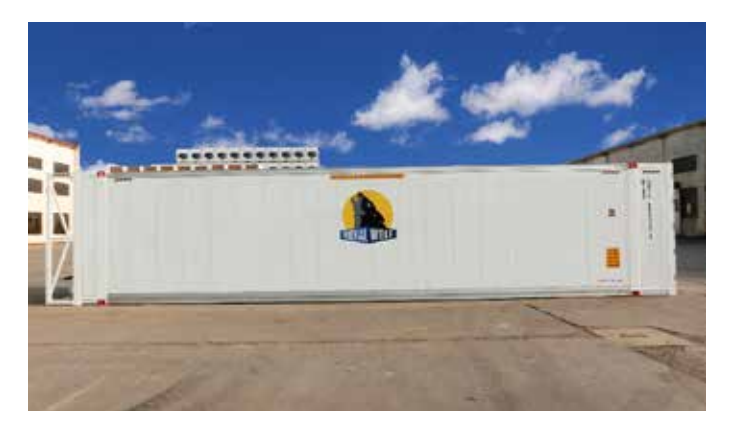
48ft Plus x 2500 x 9ft 10" (Diesel Electric Motor)