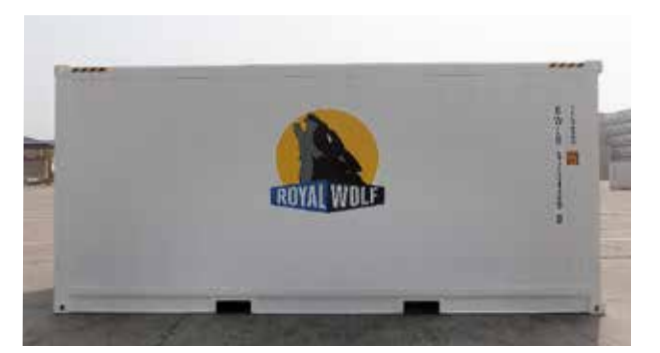
20ft ISO Electric Refrigerated Container

• Can be fitted with Thermo King or Carrier diesel or electric refrigeration units.