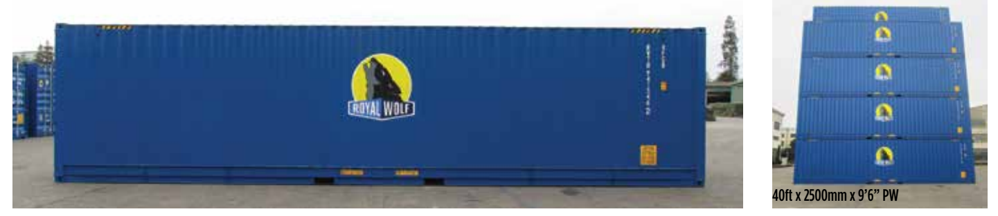
48ft x 2500mm x 9'10" PW

Royal Wolf pallet wide containers are ideal for domestic freight applications, including the removals industry, and are available for hire or sale.