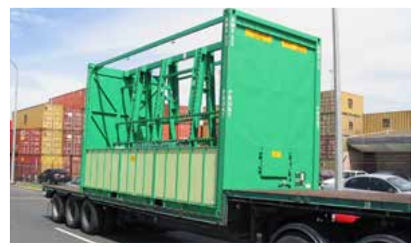
20ft x 2438mm x 11ft 6" - Glass Stillages