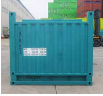
20ft x 2438 x 2160