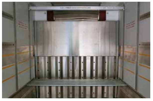
48ft Plus x 2500 x 9ft 10" (Diesel Electric Motor)