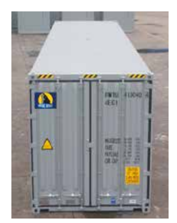
20ft x 2462 x 9'6" Slimwall