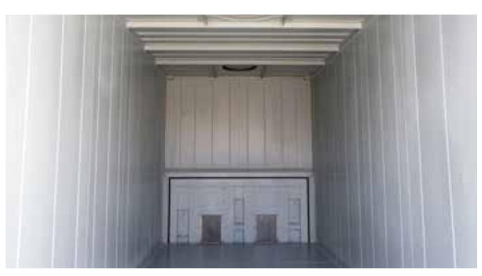
20ft x 2500 x 9ft 6" Pallet Wide Dry Bulk Container (Front Hatches)