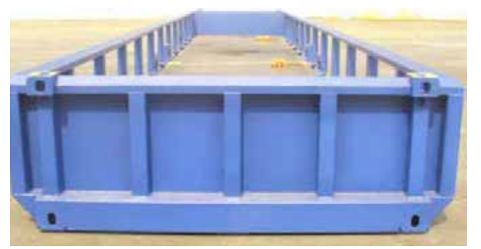
Steel Rod and Coil Racks

These units allow for large sheets of glass to be carried