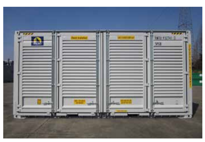
20ft x 2500 x 9ft 6" Ventilated